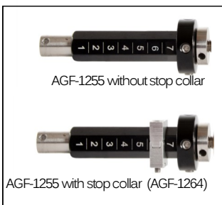
AGF-1255 without stop collar

The compound version comes with part AGF-1255 and part AGF-1264 (stop collar).